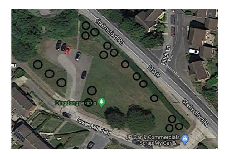
Mill Field (Great Dunmow South and Barnston Ward)

oak; and at Lower Mill Field Common May. The location of the proposed new trees is illustrated below.