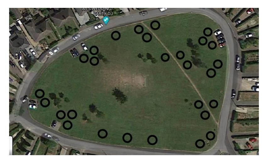
Newton Green (Great Dunmow North Ward)